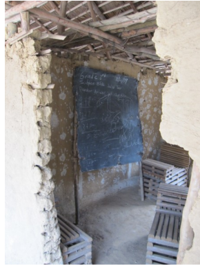
One village school needs help – a broken down wall and a bad roof