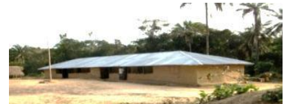
A school built by citizens of Mauwinfordor. The Mission's work is incarnational and contagious.

OTHER PRAYER REQUESTS FOR FUTURE WORK: For a potable well in Mauwinfordor, the last town to receive one and more wells in other bigger towns that need more than one. Continue the construction on the full medical clinic. For grants to finish the medical clinic. (The clinic is being built according to government specifications. When it is finished the government will staff and supply the clinic.) For people to be moved to join one of the volunteer teams that are forming to go to Liberia and blessings on the process. For other work projects to be funded and started. For God's guidance and direction at the first face to face Board meeting this year - Planning for the next two years will be the agenda. For more congregations, congregational groups, and individuals who will become mission partners.